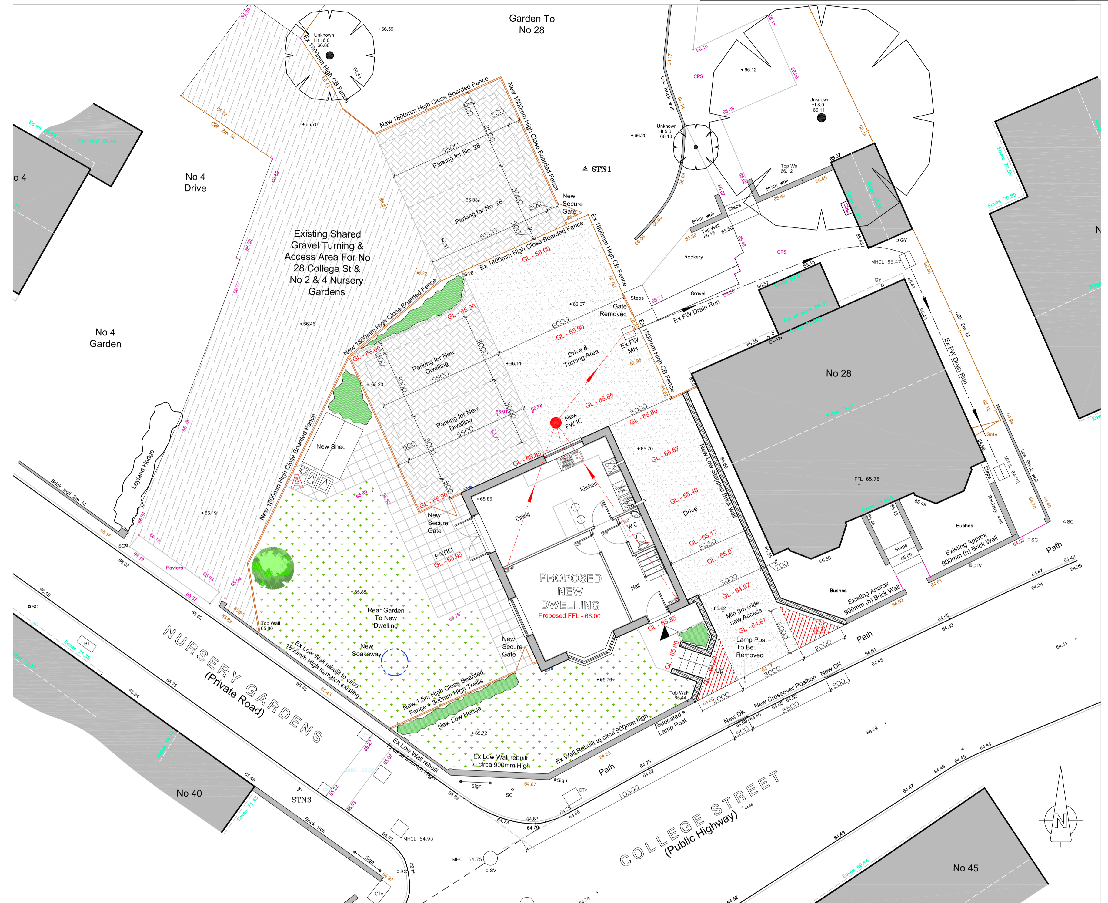
Proposed Site Plan Scale 1:100